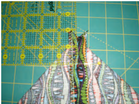
Folding and measuring the gusset

Making "T" seam at the bottom of the bag (the gusset):