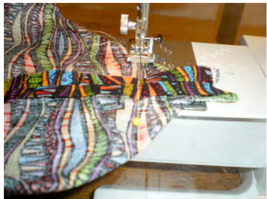
Sew across the seam to form the gusset