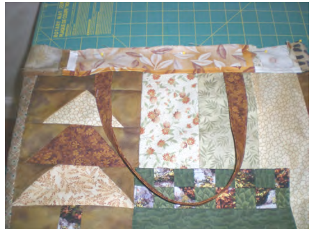
Position straps onto front and back of bag

Position straps onto front and back of bag – allow 6 inches between straps – or use front pocket sides as your guide for spacing the straps. On the front, match one end of strap with top edge of the bag; drape strap and pin other end of strap to top edge of the bag. Strap should form a “U” when each end is pinned in place. Attach second strap to the back in the same manner.