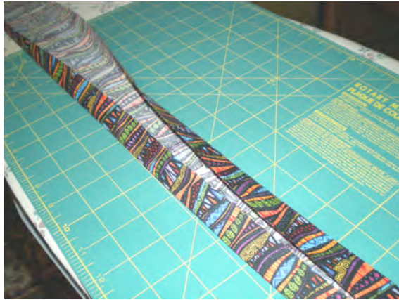
Fold and press lengthwise in half

Straps – Fold/press lengthwise in half open and press each side in to the center fold. Refold along centerline, so fabric strap is 1 inch wide and 4 layers of fabric. Pin.